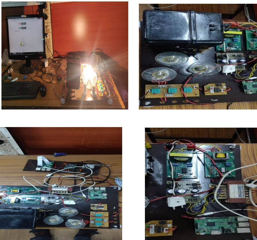
Fig. 5.2 Experimental Results